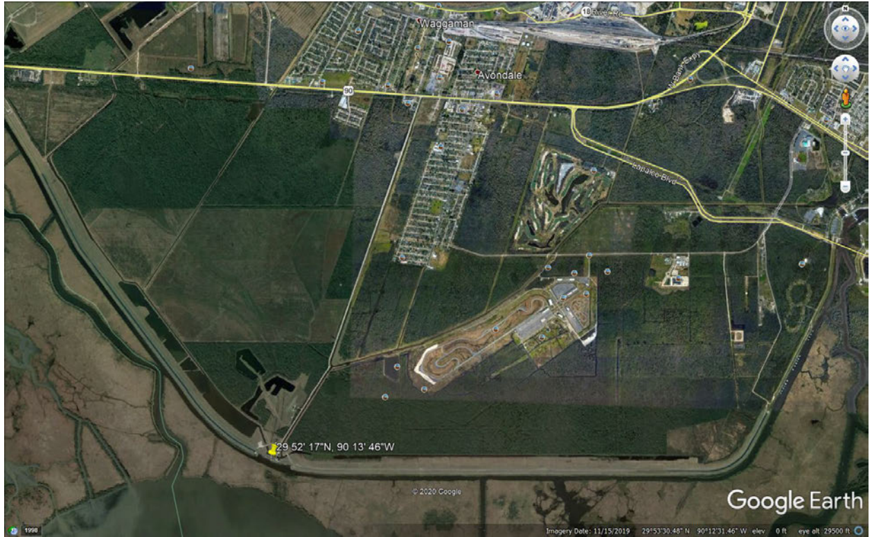
Figure 1: Vicinity Map