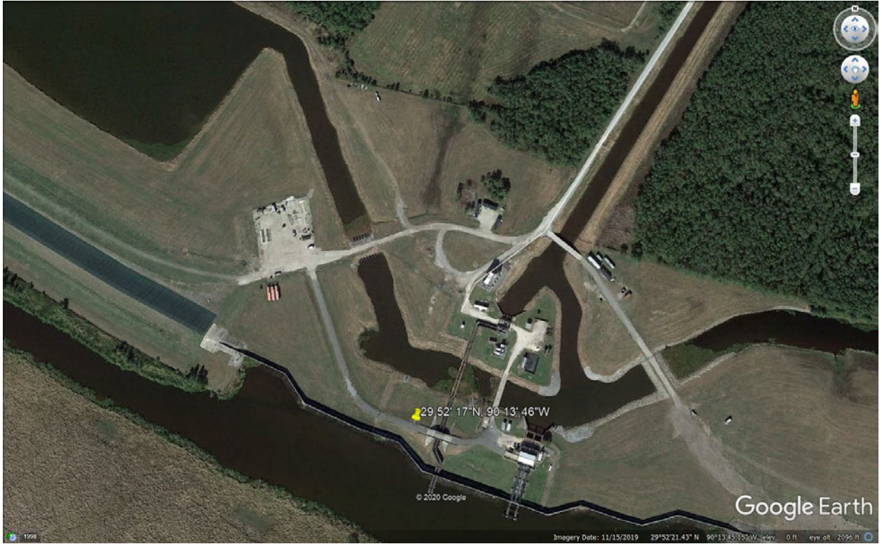
Figure 2: Aerial View